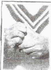
ONE RULE FOR SOME: Ball tampering

Are you hitting the bevvie too much? We can help. Come to The Priory, where you can destress in a relaxed atmosphere among like-minded people. TAM, Landford, The Priory (Happy Hour weekdays 6am-8pm)